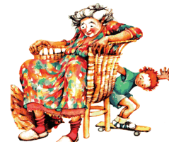
Wilfrid Gordon McDonald Partridge Written by Mem Fox. Illustrated by Julie Vivas

Say Please, Louise (another cautionary tale)